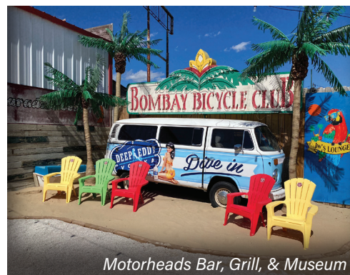
Motorheads Bar, Grill, & Museum

It's ALWAYS LEGENDARY when Abraham Lincoln or Mary Todd steps on your tour bus!